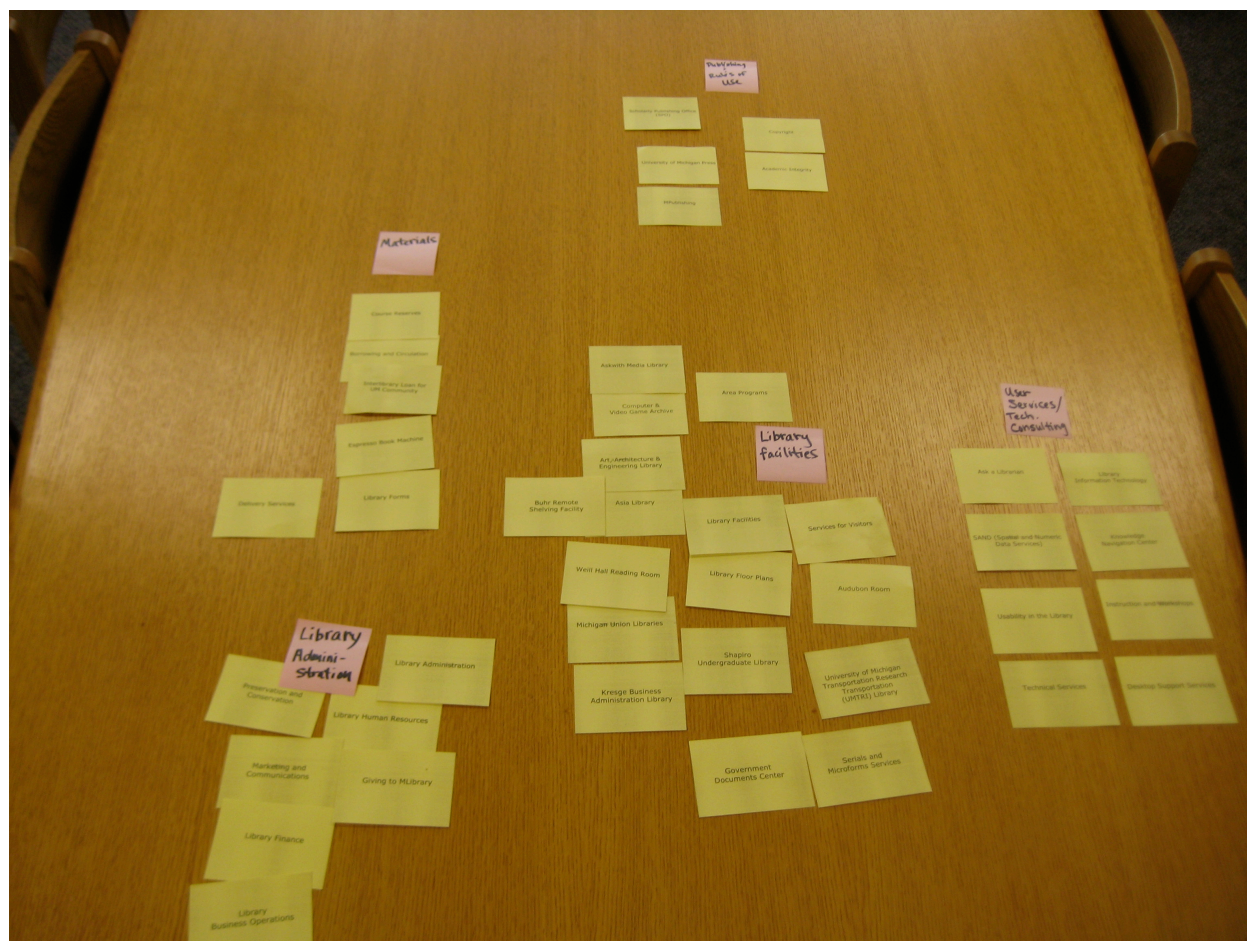
Figure 2. All categories from the graduate student group's card sort.